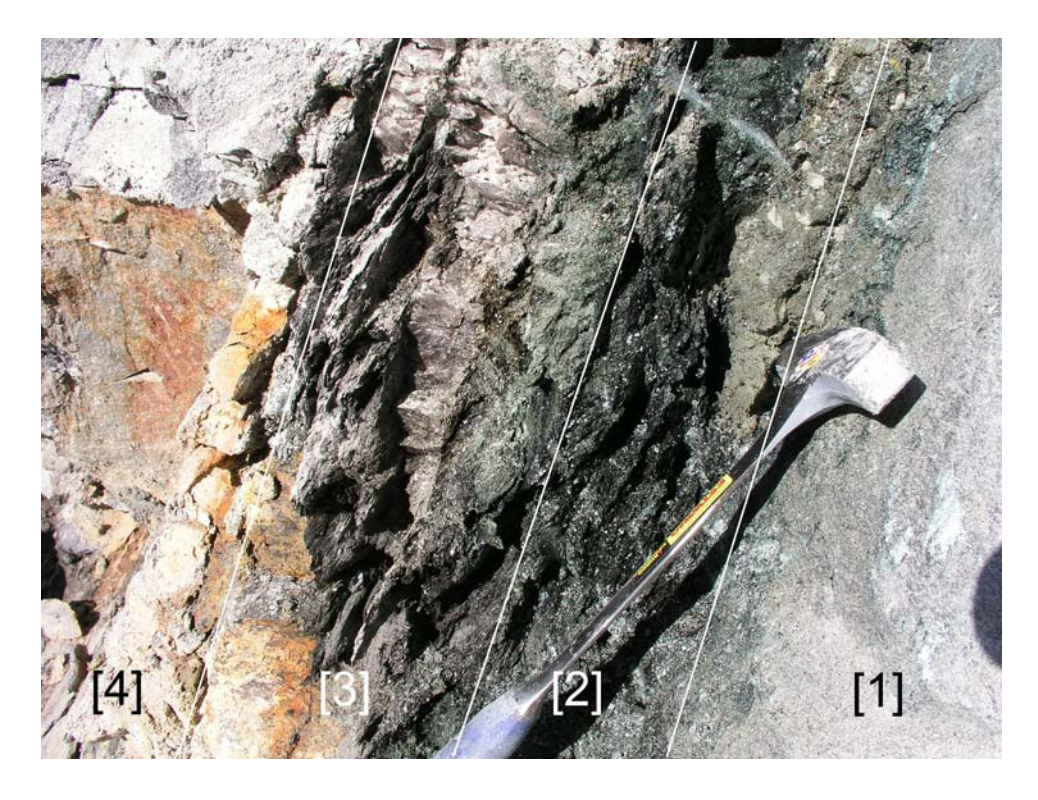
Figure 4 – Close view of the sheared western margin of serpentinite body showing the concentric zoning that (from right to left) grades from light green talc+anthophyllite schist [1] to black and green biotite+chlorite+talc schist [2] to black biotite±chlorite schist injected by smoky quartz veins [3] to massive amphibolite [4]. Outside the view of the digital image, the amphibolite is in sharp contact with isoclinally folded muscovitic schist and mica granofels of the Hartland Formation. Digital image taken 21 December 2004.

In (b), ultramafic magma from the mantle works its way upward into the continental lithosphere through deep-seated fractures and crystallizes as intrusive igneous rocks. Such high-density magmas solidify slowly to form bodies of coarse-textured ultramafic rock. Presumably during regional deformation accompanying mountain building, the ultramafic magmas are squeezed upward into the continental crust as semi-solid crystal-rich masses. These rocks are commonly serpentinized to some degree but display cumulate textures and are typically found in association with satellitic mafic plutons as well as late granitoid plutons. Examples include the Duke Island Complex of Alaska, the Hodges Complex of Connecticut, and the Cortlandt Complex of New York. Such igneous rock complexes create zones of contact metamorphism. Field relationships allow for clear distinction between serpentinites of ophiolite (a) or igneous (b) parentage.