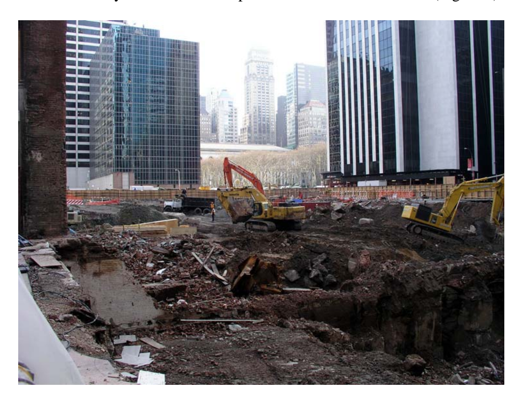
Figure 1 – View toward the SSE (Bryant Park in distance) of the One Bryant Park site showing the early stages of the excavation. Digital image taken 21 December 2004.

Starting in late December 2004 through early February 2005 we had four opportunities to examine the bedrock geology of a large construction excavation in midtown Manhattan. The One Bryant Park site covers about half a city block between 42<sup>nd</sup> and 43<sup>rd</sup> Streets, west of Sixth Avenue and was ultimately excavated to a depth of ~60' below street level (Figure 1).