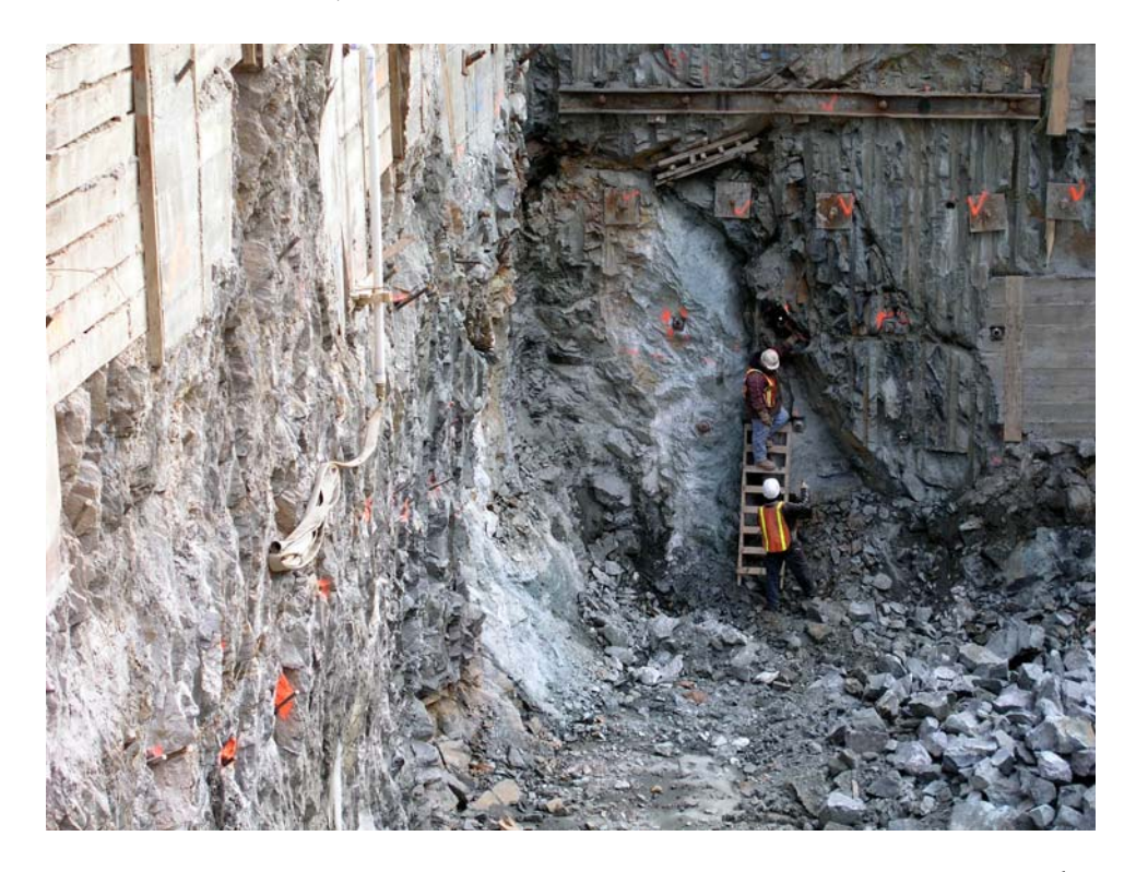
Figure 2 – View toward the ENE of top portion of zoned serpentinite found SW of the corner of 43<sup>rd</sup> Street and Sixth Avenue in Manhattan. The body exhibits a dark-colored massive serpentine core, light green talc schist and outer biotite schist zones and surrounding massive amphibolite. Digital image taken 21 December 2004.

body is roughly 5 m in diameter and extends from about 4 m below street level from the top of the excavation over 10 m to the bottom of the excavation. Massive amphibolite wraps around the top and sides of the mass but the base is not exposed so the serpentinite must extend farther down plunge below the floor of the excavation. Borings to the north and east show Hartland schist, granofels, and amphibolite but no serpentinite so the horizontal diameter may be limited to that viewed in the excavation, about 5 m.