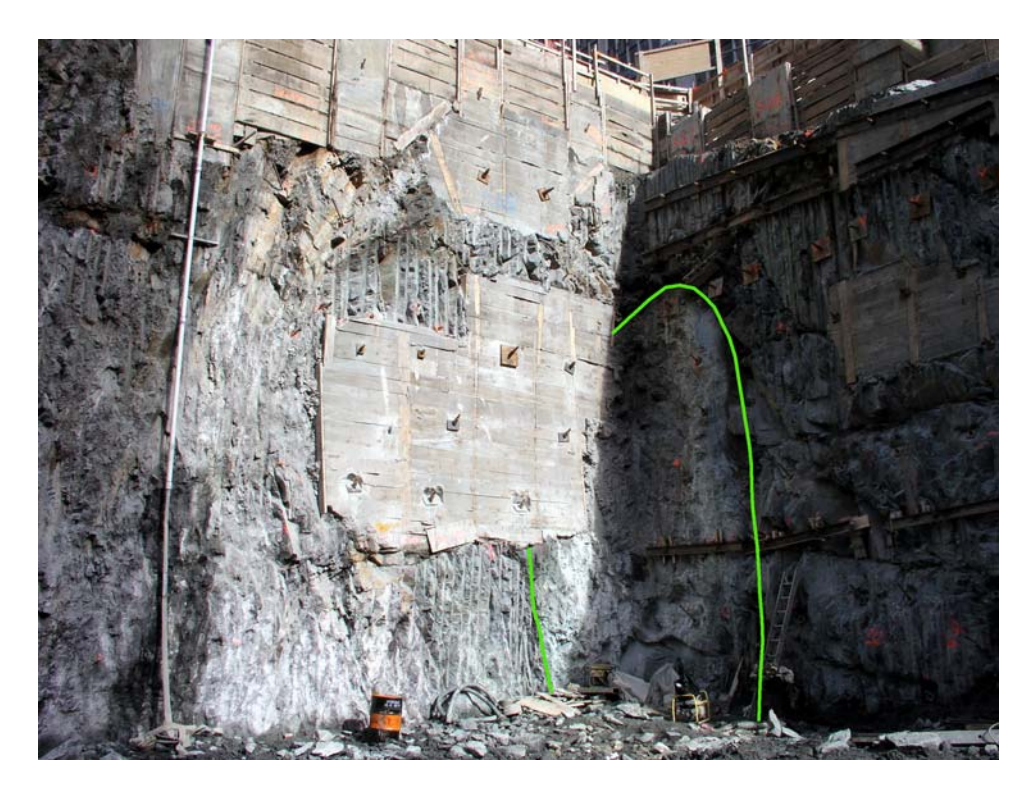
Figure 3 – View of the One Bryant Park serpentinite mass (outlined in green) near the end stage of the excavation showing the surrounding units. By our final visit some of the exposed schistose layers of the serpentinite needed support as they started to unravel along the north wall of the excavation. Support involved the installation of a concrete retaining wall and rock bolts. At this point in the excavation process the overall ellipsoidal shape of the serpentinite mass was clearly visible but the base was not exposed. Digital image taken 07 February 2005.