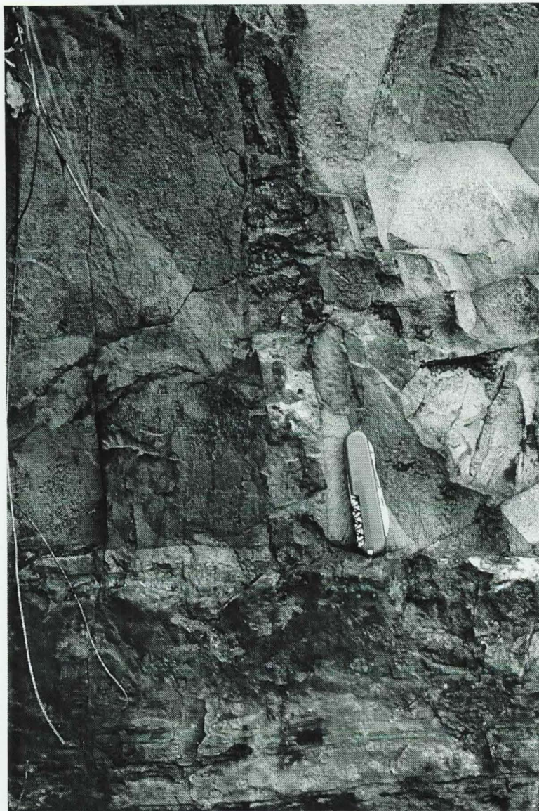
Figure 3 - Photograph showing a 3-cm-thick feldspathic "clastic dike" intruded into the Palisades chilled margin. Knife (scale) is 9 cm in length. (CM photograph.)