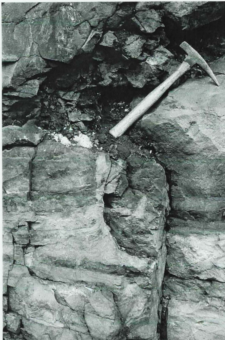
Figure 2 - Photograph illustrating a feldspathic sand "apophyse" intruded upward, beyond level of hammer, from contact-metamorphosed Lockatong into chilled Palisades basalt. The hammer handle is 30 cm in length and rests on the basal contact of the Palisades chilled-margin basalt. (CM photograph.)

magmatic flow. The drusy cavities, together with the basalt microvesicles and pipe amygdales noted earlier, support the view that the clastic-dike materials included a vapor phase. We surmise that the bounding sediments still contained pore water before the cooling Palisades magma heated them. Thus, we envision that the sandy injections and dikes represent tongues of hot, fluidized cohesionless sand that were driven by pore waters in the Lockatong and its sandy interlayers that had been vaporized by magmatic heat.