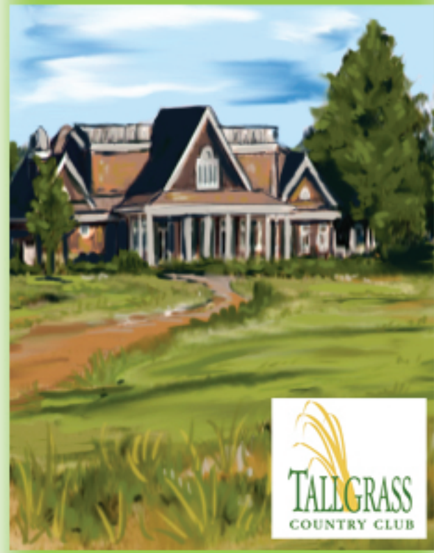
Registration Deadline is Friday, April 27, 2012

Price Includes: Golf, Range Balls, Cart, Lunch, Dinner, Beverages & Golf Gift