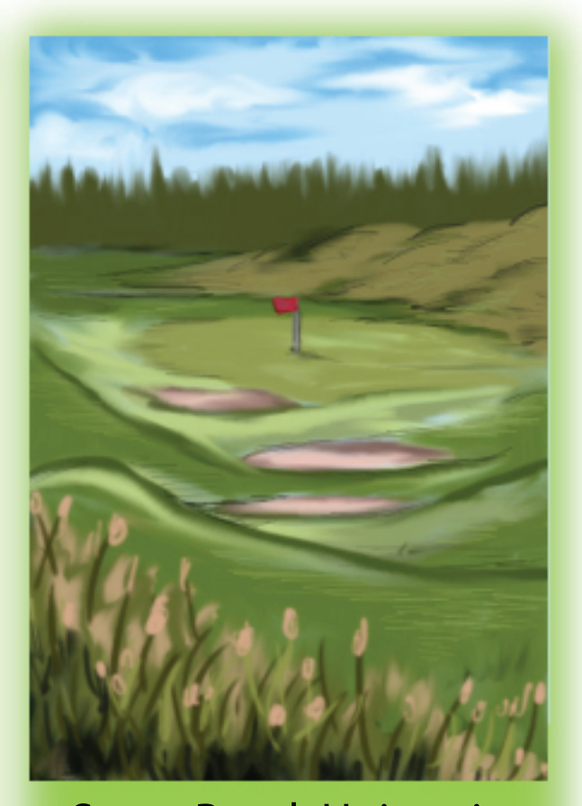
Stony Brook University Department of Campus Recreation