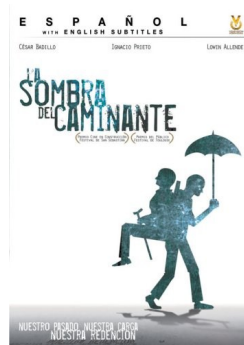
La sombra del caminante (2004) Dir. Ciro Guerra Wednesday November 2nd 6:30pm-8:30pm

This road trip movie shows Malú and Jorgito trying to overcome the social and political differences lived by families in Cuba