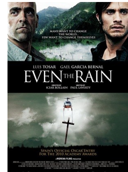
También la lluvia/ Even the rain (2010) Dir. Icíar Bollain Friday November 4th 1:30pm-3:30pm

In this Italian-Braslian coproduction, Guarani indians decide to fight for their ancestors' land, while trying to adapt to the demands of globalization