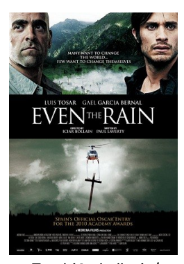
También la lluvia/ Even the rain (2010) Dir. Icíar Bollaín Friday November 4th 1:30pm-3:30pm

In this Italian-Brasilian coproduction, Guarani indians decide to fight for their ancestors' land, while trying to adapt to the demands of globalization