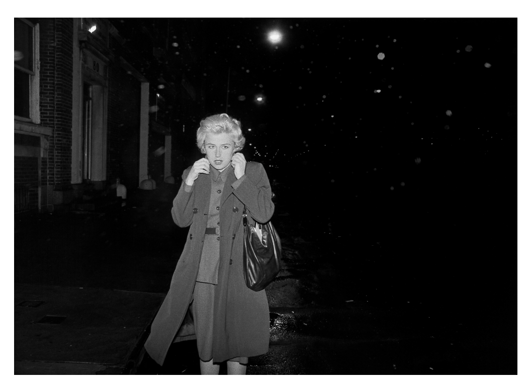
Fig. C.1. Cindy Sherman, Untitled Film Still #54 , 1980, black and white photograph, 8 x 10 inches, 20.3 x 25.4 cm, Edition of 10, (MP# 54), Courtesy of the artist and Metro Pictures, New York.

Few of Them," Sherman is commenting on the fact that "everybody all day long knows what is happening and so what is happening is not really interesting, one knows by radios cinemas newspapers biographies and autobiographies" (Scott, The Gender of Modernism 497). Essentially Sherman is performing a performance already in play; indeed, many of the Film Stills look as if the viewer caught her in the middle of a narrative, and in this way, her work further crosses the line between text and image. For example, in Untitled Film Still #48 (1979) Sherman stands with suitcase on the side of darkened road, waiting for something or someone that is not clear. With no cars or buildings in sight, it is even uncertain how she arrived at this desolate location. In Untitled Film Still #54 (1980),