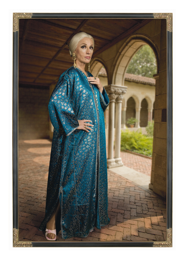
Fig. C.2. Cindy Sherman, Untitled , 2008, color photograph, 96.875 x 64 inches (image), 246.1 x 162.6 cm,101-7/8 x 69-1/4 inches (frame), 259 x 176 cm, Edition of 6, (MP# 466).

Untitled #465 (2008) offers a profile that recalls ancient coins; she faces sideways and then turns her head toward the viewer. Her hair also is carefully pulled back and she wears scant, expertly applied eye makeup but the heavy foundation and blush emphasizes sagging skin and enlarged pours. Thus, like the characters in the literature I discuss, Sherman's characters, and Sherman herself, rely on mass production to articulate their identities as modern subjects or, in the case of the Film Stills and the Old Master paintings, modern objects.