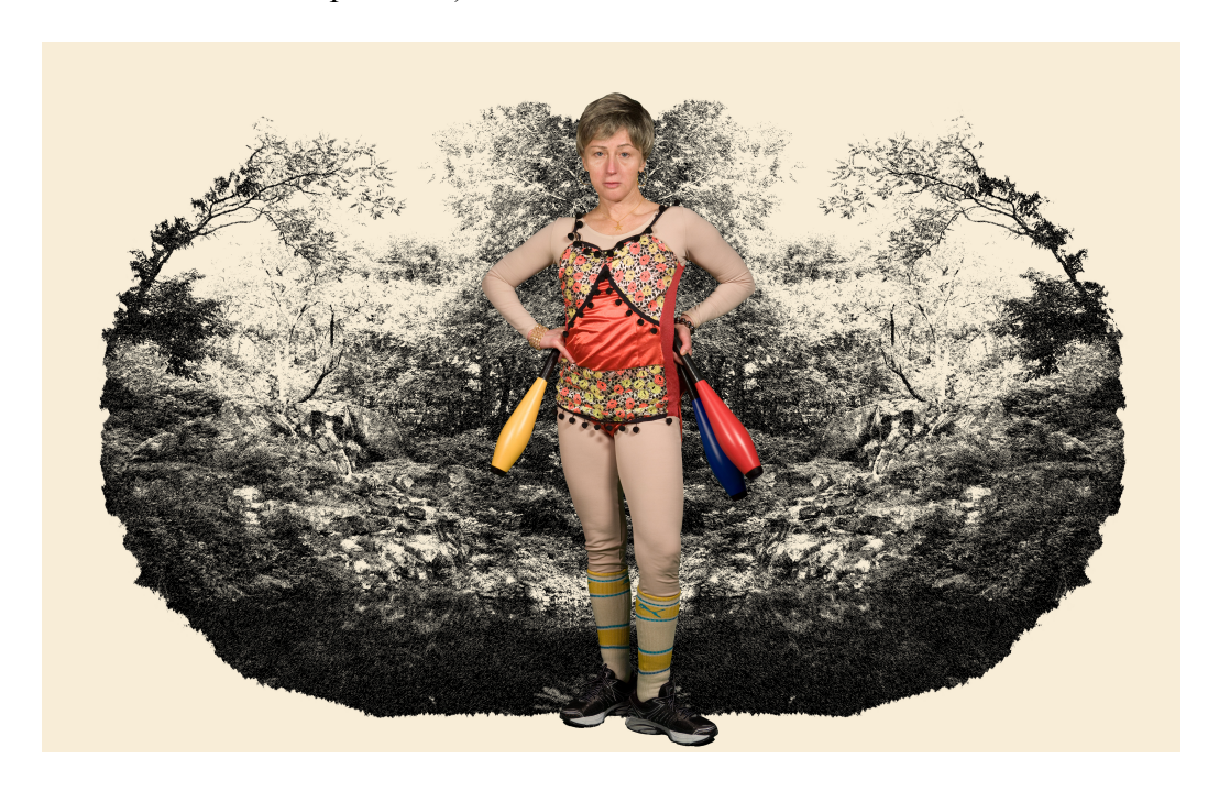
Fig. C.4. Cindy Sherman. Untitled , 2010, Pigment print on PhotoTex adhesive fabric dimensions variable, (MP# 498).

possibility that the artifacts can be exchanged as high-end commodities (though smaller reproductions are of course possible.)