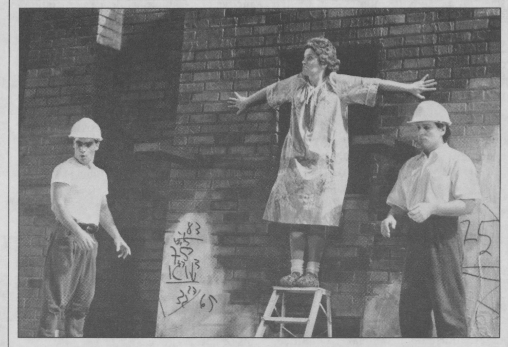
Dynamo Theatre/La Troupe Circus: Staller Center for the Arts, Main Stage. Exciting, fast-paced. Tickets: $14/$7 for children, 8 p.m.

Art Exhibit: Art exhibit and reception for CED students. Social & Behavioral Sciences Building, Room S-102.