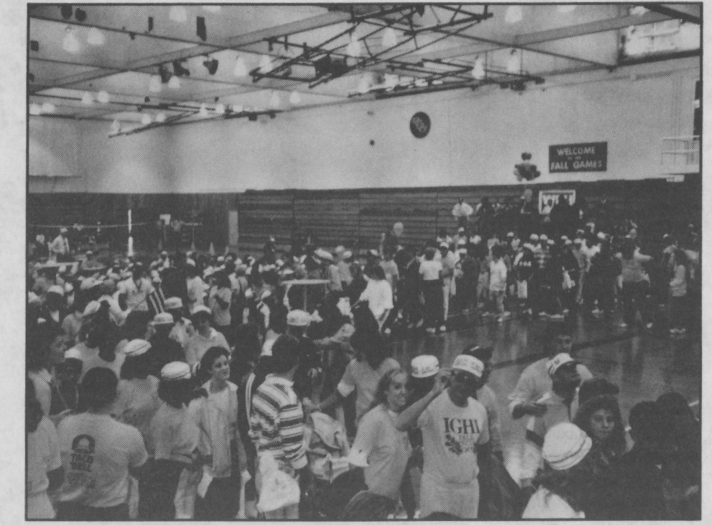
EVERYONE'S A WINNER. Hundreds of athletes participated in the second annual Suffolk County Fall Special Olympics Adult Games Oct. 25 in the Gym and Stony Brook Union. The games provide athletes 20 years old and older to experience sports training and competition. The emphasis is on participation; everyone receives a medal and is considered a winner.

For more information, call the Sleep Disorders Center at 444-2916.