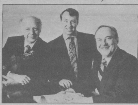
Beaux Arts Trio