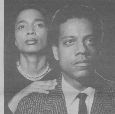
National Black Touring Circuit

Subscription and single ticket purchases can be made through the Staller Center Box Office, (516) 632-7230.