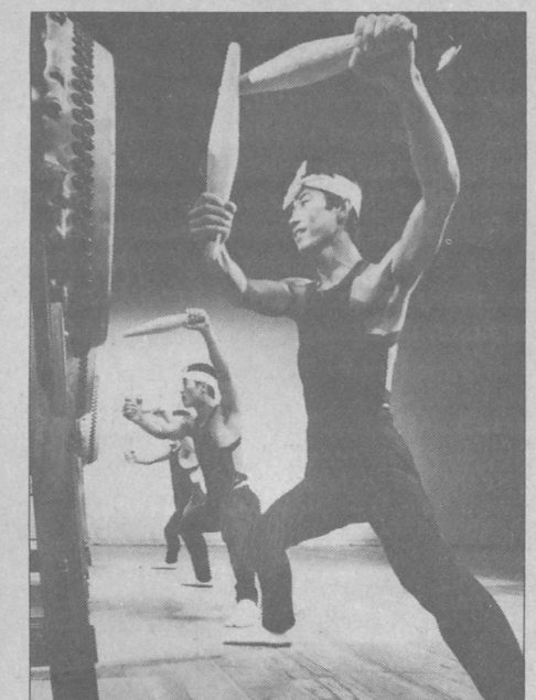
Kodo Drummers of Japan