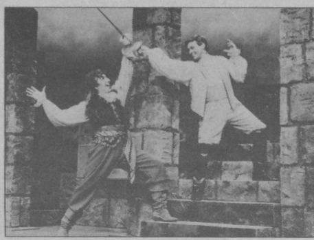
New York Gilbert & Sullivan Players