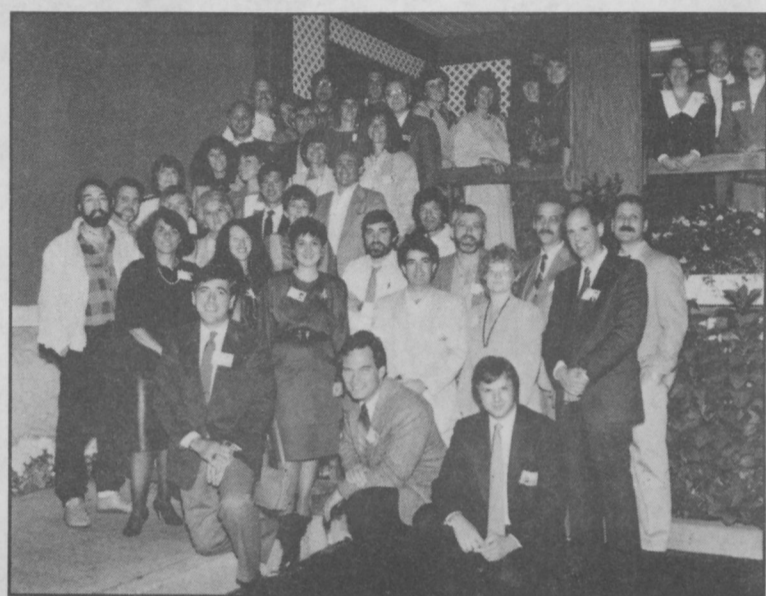
Members of the Class of 1967 gather for a 20th reunion dinner at Port Wind Restaurant in Port Jefferson.