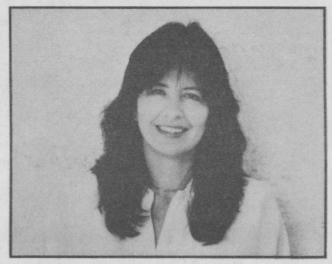
Native American poet Joy Harjo