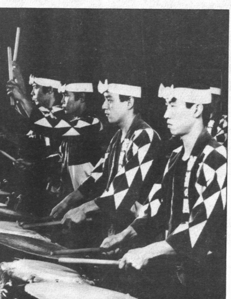
The Kodo Drummers of Japan, part of the Staller Center Theatrical Series, will perform March 2 at the Staller Center.

Discussion, "Women's Roles in Developing Nations." 8:00 p.m., Main Lounge, Keller International Studies Living/Learning Center. Call 632-6798. *