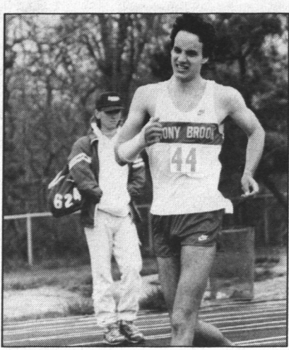
The Men's Outdoor Track Team hosts the Stony Brook Quadrangular, March 31 at noon.