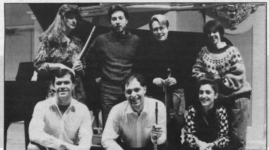
The Stony Brook Contemporary Chamber Players.

Monday, June 11: Humanities Institute Film Series Annual Fund Raiser. Reception for and screening of Suffolk County Film and Video Competition Finalists. Co-sponsored by the Humanities Institute, the Greater Port Jefferson Arts Council, the Port Jefferson Village Cinema and Theatre Three. Tickets are $3.8:00 p.m., Theatre Three, 412 Main Street, Port Jefferson. Call 632-7765.