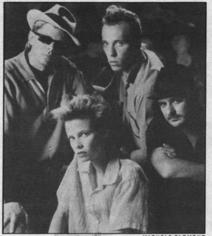
Devoted to the best in contemporary music, the Kronos Quartet has transformed the image of the string quartet. Described in the national media as "intense," "unconventional" and "brilliant," the quartet is playing at Stony Brook March 30. Tickets are $14, $12 for senior citizens and $7 for Stony Brook students. The concert begins at 8:00 p.m. in the Recital Hall of the Staller Center for the Arts.

COMING EVENTS AT THE UNIVERSITY AT STONY BROOK ■ MARCH 16 - 31, 1990 ■ VOLUME 2, NUMBER 4