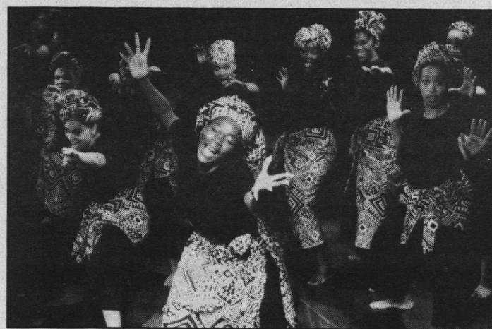
The cast of Sheila's Day performs June 26-30 at the Staller Center for the Arts.

An ensemble piece from Czecholovakia, the final production of the summer is the work of Czech star Bolek Polivka. Seance makes its American premiere at the festival July 17 - 21 and marks