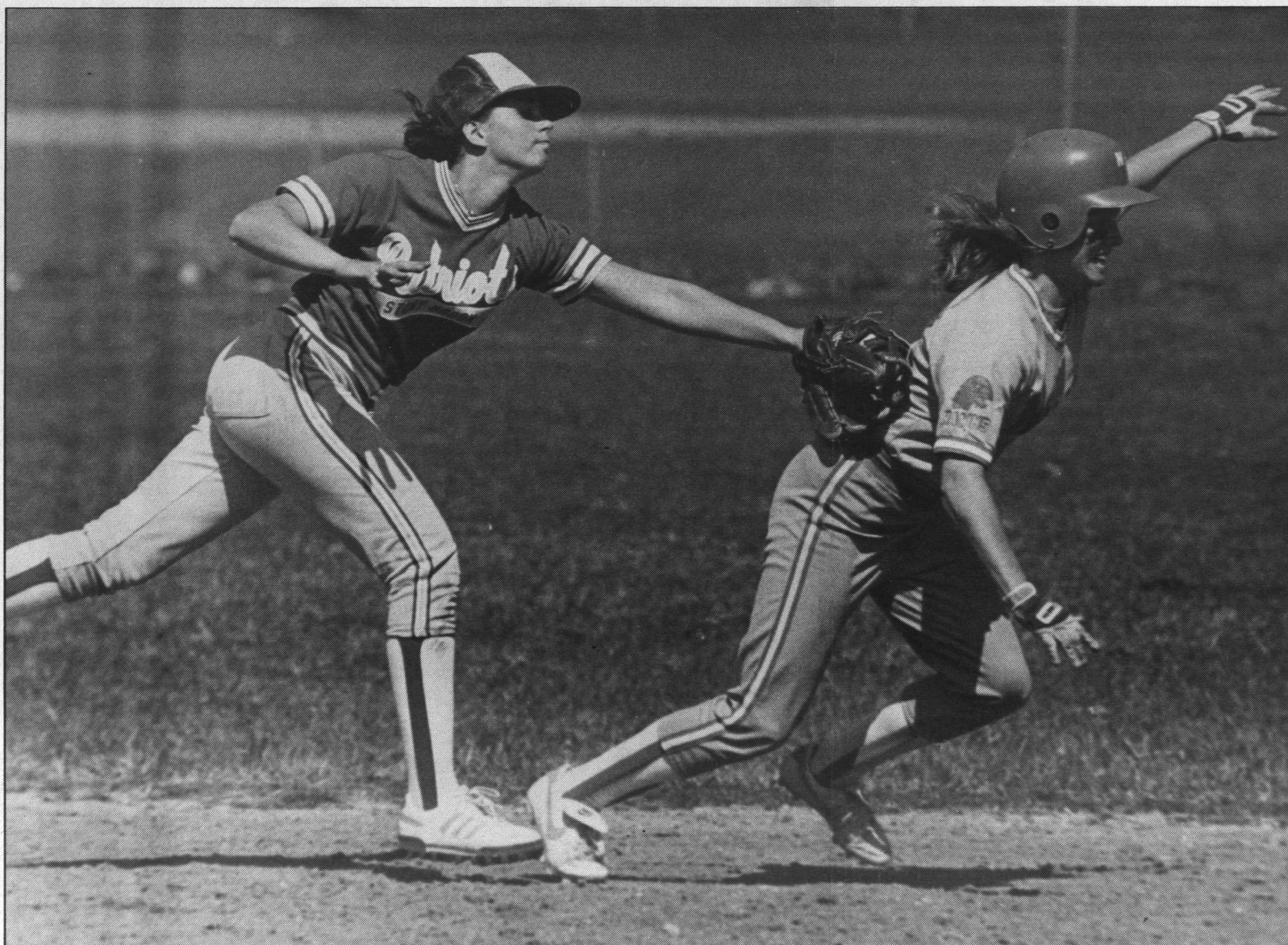
The women's softball team takes on Manhattanville College April 5 at 3:30 p.m.