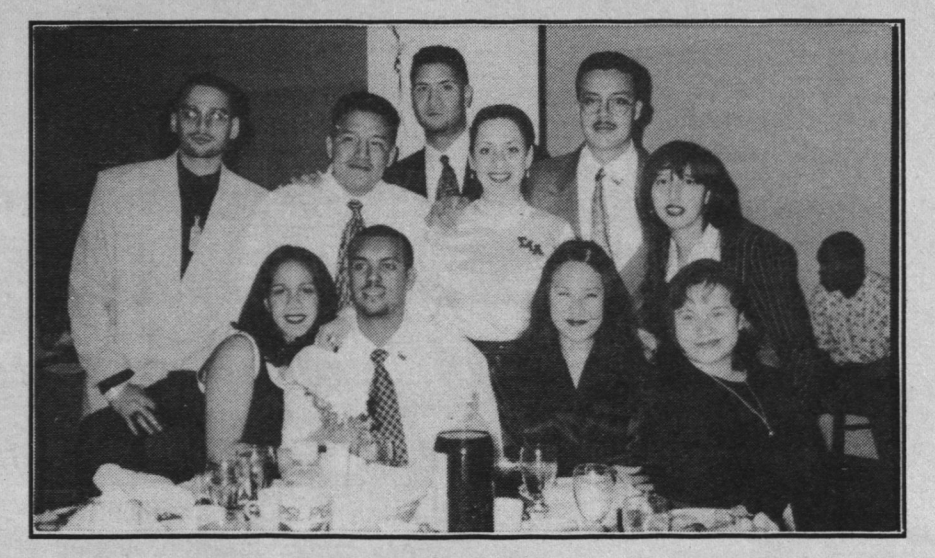
One of the many tables that L.A.S.O. occupied at the banquet

Sunday include a Career/Job fair for everyone. There were over twenty-two companies and