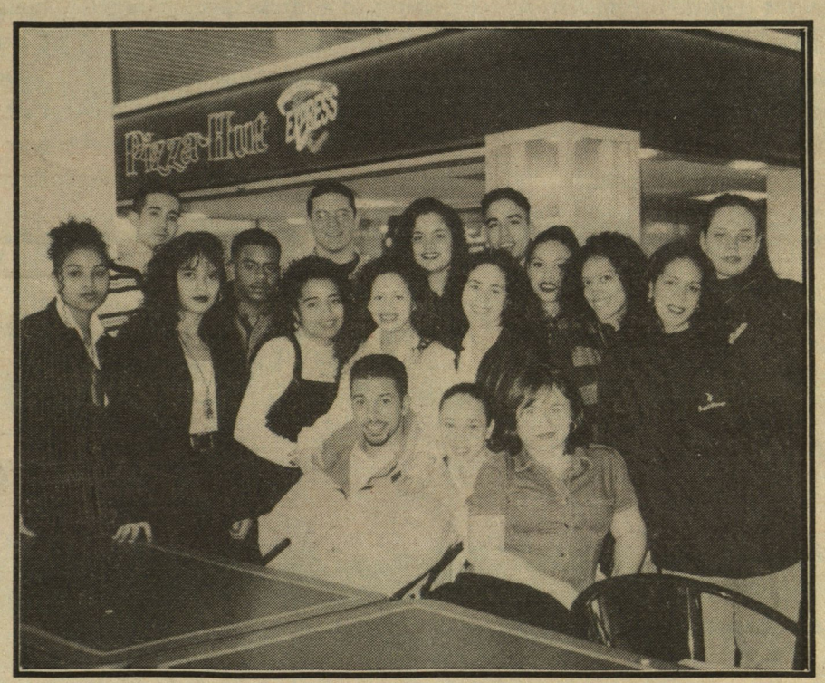
The students from the Latin American Student Organization

At approximately 12:30pm, the conferences/workshops began. Some types of workshops included Reform vs.