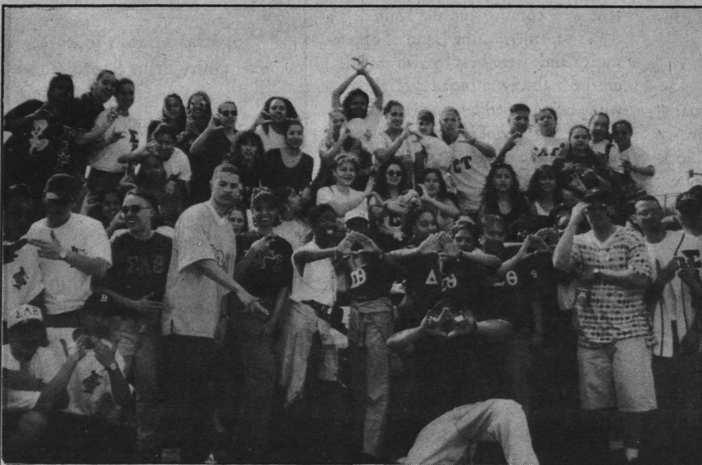
All Latin greeks and non-Latin greeks who came and showed support.