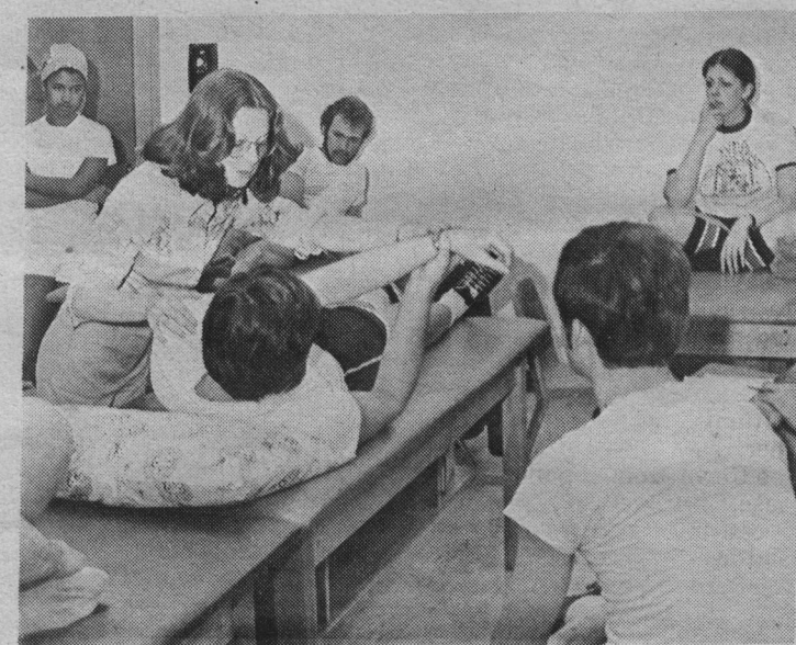
Physical Therapy Students Learn Therapeutic Techniques While Working on One Another.

The Physician's Assistants sponsored two bake sales, one of which was at Roosevelt Field, in conjunction with a Blood Pressure Clinic set up by the Seniors. P.A. students also attended conventions in Albany and in Houston, Texas.