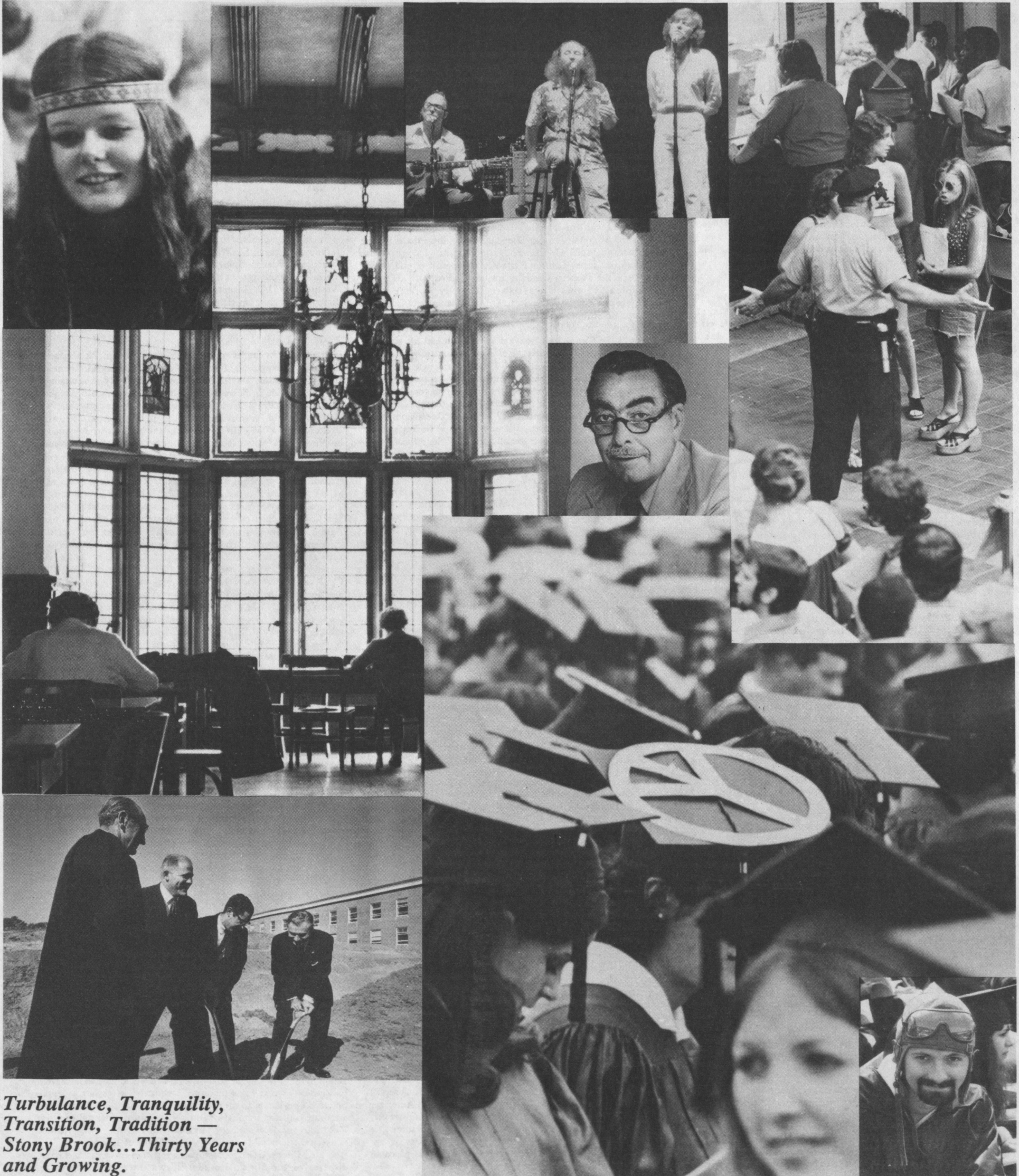
Turbulence, Tranquility, Transition, Tradition — Stony Brook...Thirty Years and Growing.