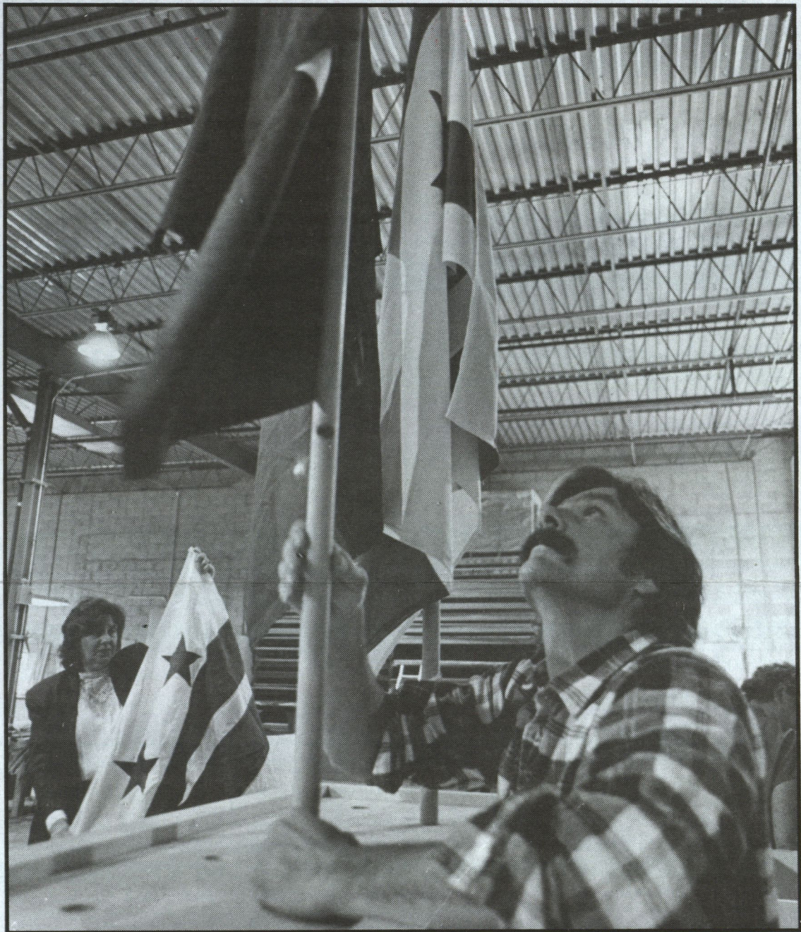
Maxine Hicks Photos

Volume 1, No. 5 • News for and about the University at Stony Brook campus community • September 28, 1994