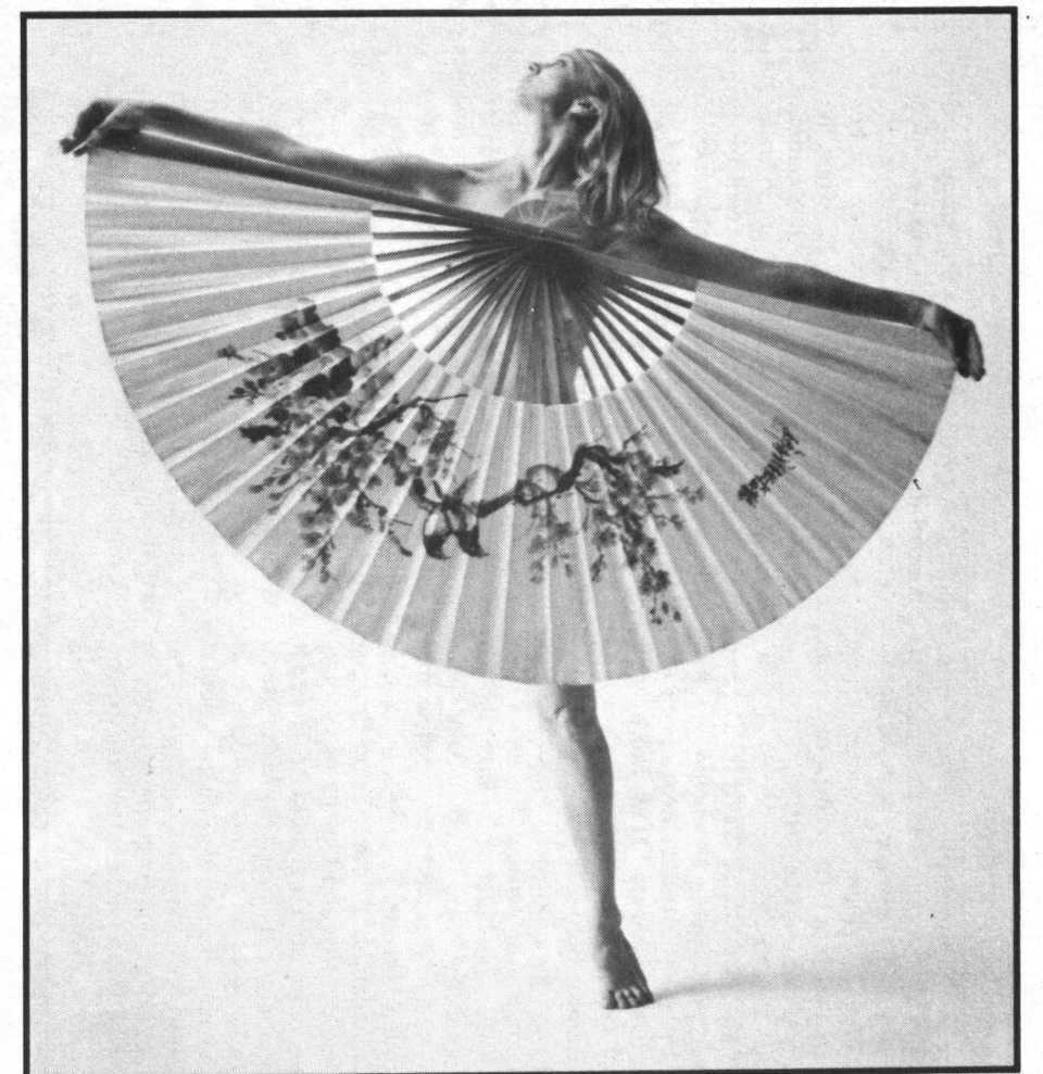
Momix presents its unique style of modern dance at the Staller Center on November 19.

Gallery hours are Monday through Friday, noon to 4 p.m. For additional information, call 632-6822.