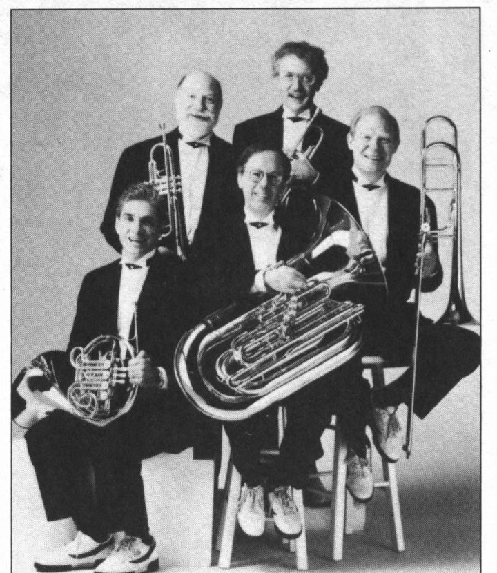
The Canadian Brass will perform a holiday concert with a children's chorus, the Harmonaires, on Saturday, December 10, at 8 p.m. in the Staller Center for the Arts. Call 632-7230 for tickets.

The Annual Messiah Sing-along, accompanied by full orchestra and featuring outstanding soloists, will be held on Sunday, December 11, at 3 p.m. in the Recital Hall of the Staller Center. Participants are welcome to bring their own scores or purchase them at the door. Admission is free and open to the public.