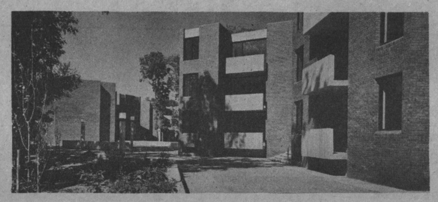
Views of the new Stage XI quadrangle northwest of Tabler.

To help break both the intellectual and social bottlenecks, he says, "We could afford to experiment more with islands of homogeneity. I don't mean narrow groupings, like putting all chemists in one dormitory, but rather groupings based on broad areas of common interest, such as public affairs or various pursuits in the arts or humanities."