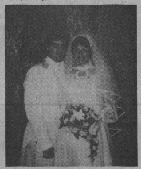
Board Members Tie Knot

Are you interested in taking part in a new Alumni Undergraduate Admissions Recruitment Program? If talking to students about Stony Brook appeals to you, please send a note with your name and address to the Alumni Office. We are particularly looking for alumni from Buffalo, Rochester, Syracuse and the Capital District (Albany).