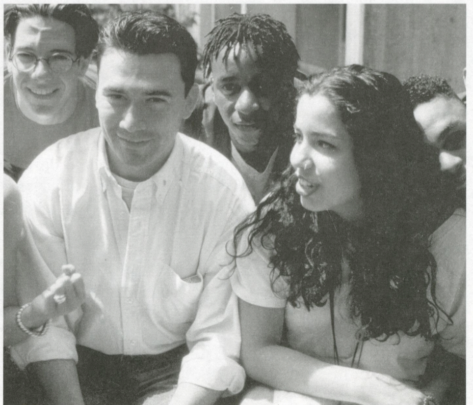
Providing support and guidance to new students is a vital initiative.