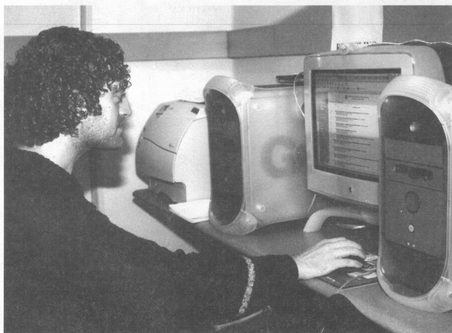
The campus computer network will be enhanced with the additions of new equipment and upgrades to data and voice systems.

• Complete Phase II of the Student Activities Center to include a large student lounge, student programming space, and a wellness center.