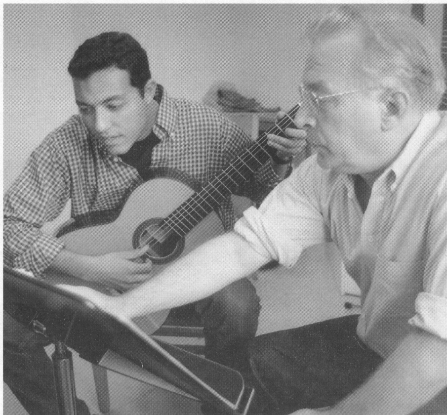
Faculty interaction is critical to a student's success.

Goals: To make Stony Brook family-friendly. To make our faculty more representative of all the groups who make up the United States population, including women and the African