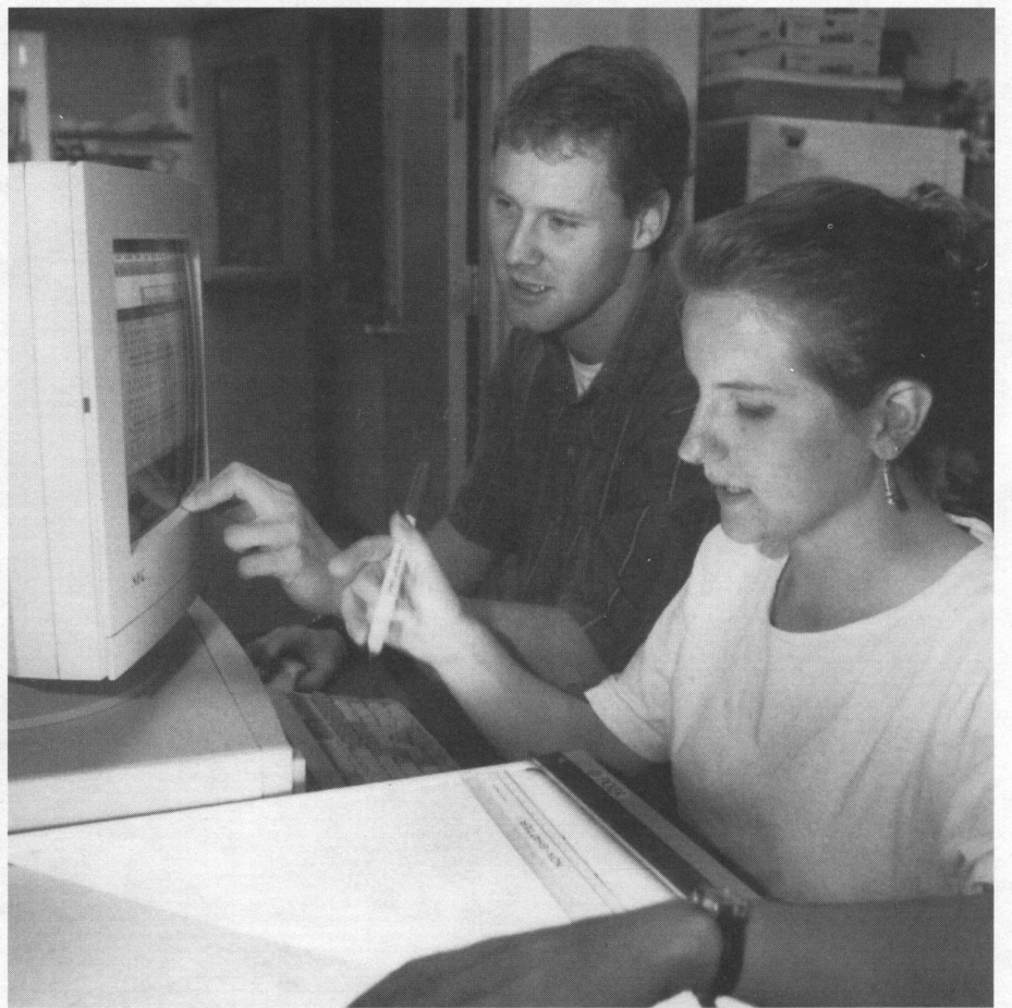
Graduate students and postdoctoral associates form very significant components of the Stony Brook community.

• A committee of faculty and graduate students should create and implement a strategic plan to increase TA stipends to be competitive with other Research I universities.