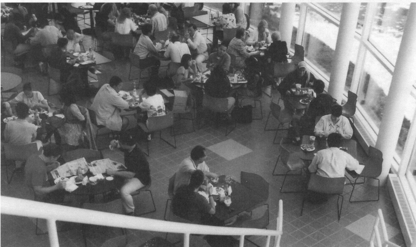
Enhancing student life on campus is a major goal of the Five Year Plan.