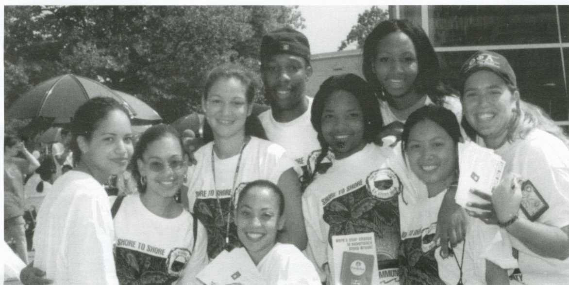
The Stony Brook Welcome activities held each semester give new students the opportunity to meet and make friends, while learning about what the campus has to offer. Above, students enjoy a moment during one of the August 1999 Stony Brook Welcome events.

W elcome to Stony Brook. We are so glad you have decided to join us for this milestone year. The 1999-2000 school year started off with great excitement, and is only getting better. This fall, we played our first season of NCAA Division I athletics, opened the Centers for Molecular Medicine (a revolutionary research