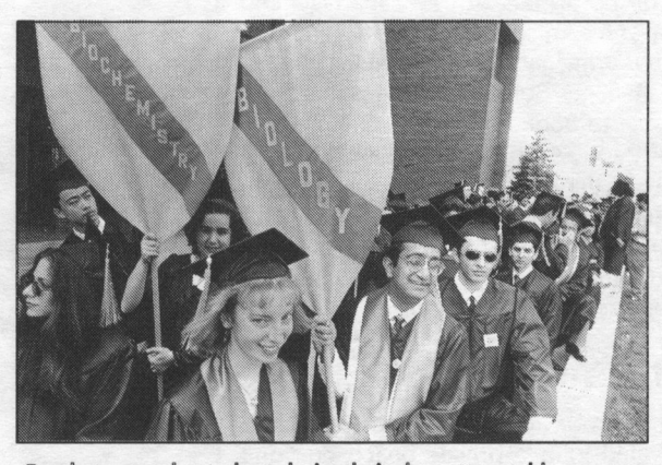
Ready to march, students hoist their departmental banners.