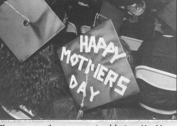
There was more than one reason to celebrate on May 14.