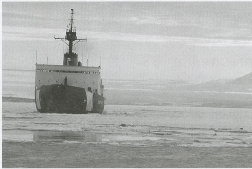
Research takes MSRC faculty to all corners of the globe, including the Arctic Circle. Faculty will share stories of their latest research adventures as part of the Open House festivities.

Special events include Long Island seafood dishes prepared by Guy Reuge, chef at Mirabelle Restaurant; presentations on MSRC research around the globe; and a game of environmental Jeopardy for kids. Teachers will be able to enter a drawing for a free educational cruise for themselves and their class on the MSRC research vessel Onrust .