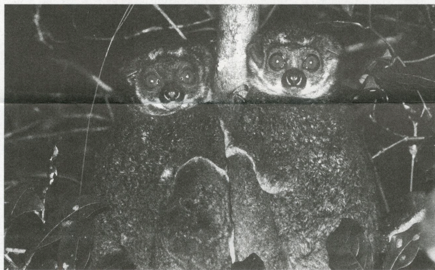
Study abroad students have studied the lemur populations of Madagascar.

Faculty and staff are invited to participate in WISE as advisors, project leaders, or members of its working group. All are welcome at WISE's evening events, held throughout the year. Coming up is an exciting series of lectures sponsored by Salomon Smith Barney (SSB) titled "Women in Technology: Young Women at the Crossroads." The kickoff lecture, "Breaking Out of the Box," will feature four executives from SSB and Citigroup on Tuesday, October 17, 6:00 p.m.-8:00 p.m., in the SAC Auditorium. To learn more about WISE, call the WISE office at 632-6947.