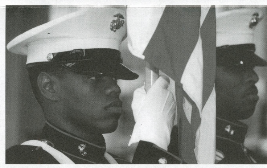
U.S. Marine Corps color guard opened the ceremony.

For more information about these groups and how you can contribute your time, please call 632-9550.