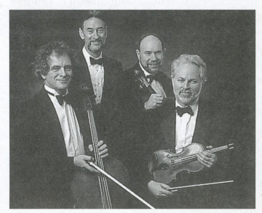
The Juilliard Quartet performs at Staller on Friday, May 14.