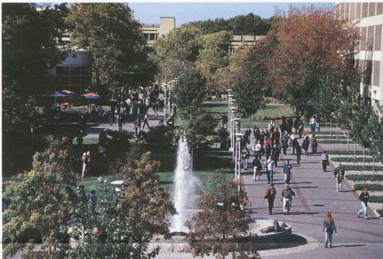
Take a tour of the new wing of the Student Activities Center between 1:15 p.m. and 5:00 p.m. on September 4.

On September 4 at 12:30 p.m., the festivities will kick off with a ribbon-cutting ceremony and tours of the new wing in the Student Activities Center. SAC Phase II is home to a spacious student lounge with a café, game tables, couches, and chairs; two multipurpose rooms, one accommodating 750 people and the other 350; an enhanced Eugene Weidman Wellness Center with locker rooms and showers; and an art gallery. Take a tour of the new wing and enjoy free giveaways and a variety of events including concerts, a hypnotist, a movie, student dance parties, a step show, and more. Everyone is welcome—join the fun!