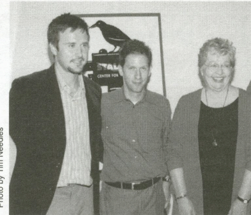
Actor David Arquette (left) and writer/director Blake Nelson (center) from the film The Grey Zone , with President Kenny on opening night.

Now in its seventh year, the 2002 Stony Brook Film Festival had more than 15,000 attendees for the 40 feature and short films during the 11-day festival, which ran from July 17 to 27. The festival featured new independent films, world premieres, and some of the year's most highly acclaimed films. Several films that premiered at the festival are now in negotiation for distribution.