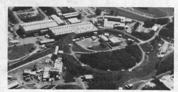
Brookhaven National Laboratory

In collaboration with colleagues at the Brookhaven National Laboratory and elsewhere, Stony Brook scientists are seeking solutions to the energy problems of the region and nation.