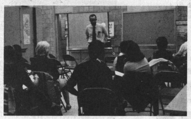
Local students and teachers make use of the Science and Mathematics Teaching Center to develop, test and analyze new curriculum materials.