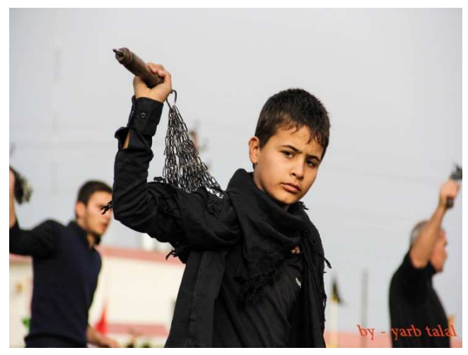
Figure 3: A 14-year-old boy is flagellating himself

son to flagellate and do Tatbeer, thinking that flagellation and Tatbeer are signs of strength and manhood (See Fig. 3)