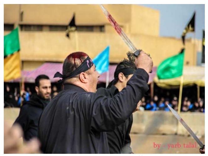
Figure 2: Tatbeer<sup>16</sup>

Sunni Muslim Mufti Muhammad Taqi Usmani, one of the leading Islamic scholars living today, writes his opinion about Tatbeer, lamenting the practice and saying: