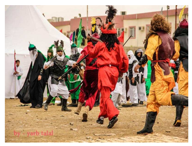
Figure 4: The Tamthiliya (or the passion play): confrontation between Husayn's and Yazid's men

The face of the actor who is acting or playing Husayn's character is not presented but rather covered with a piece of white silky fabric that gleams against the sun. It is agreed by the Islamic scholars that no one is permitted to act the prophets or other famous and important Islamic figures because of religious ethics of reverence and respect. On the other hand, Yazid-actor is of bare face and depicted as a disgusting figure to symbolize the ugly villain.