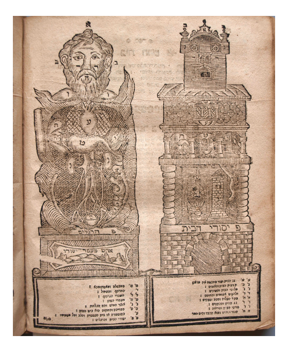
5. Anatomical Illustration , woodcut. In: Tobias Cohen, Ma'aseh Tuviyah , second edition (Jessnitz, 1721)