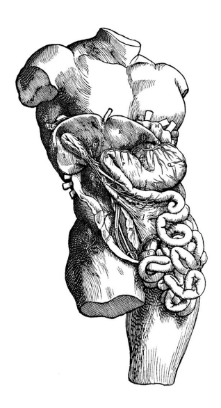
2. Image 5.12 , woodcut. In: Andreas Vesalius, De humani corporis fabrica libri septem , 1543