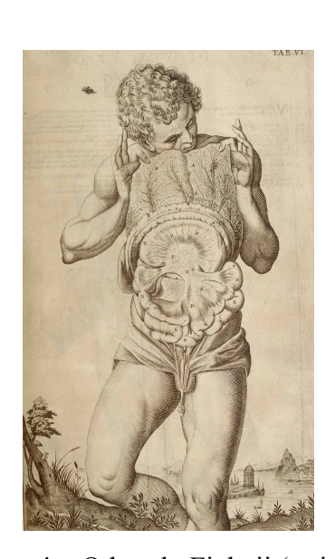
4. : Odoardo Fialetii (artist), copperplate engraving. In: Giulio Casserio, Tabulae Anatomicae LXXIIX , omnes novae nec antehac visae (Venice, 1627), p. 69