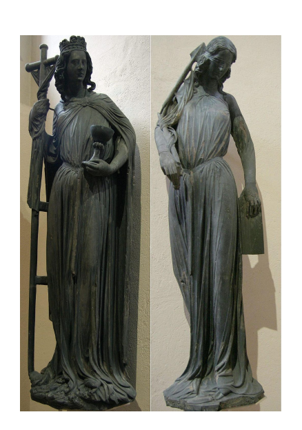
9. Ecclessia and Synagoga , South Portal, Strasbourg Cathedral, stone, c. 1230