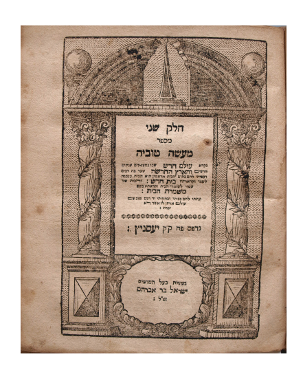
12. Title Page of Part II , woodcut. In: Tobias Cohen, Ma'aseh Tuviyah , second edition (Jessnitz, 1721)