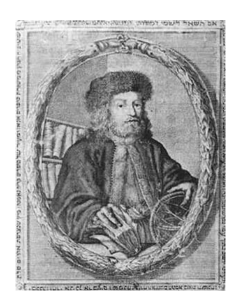
7. Frontispiece with Portrait of Tobias Cohen, woodcut. In: Tobias Cohen, Ma'aseh Tuvya