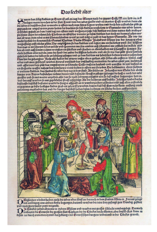
6. Simon of Trent, woodcut. In: Hartmann Schedel, Liber Chronicarum cum figures et imaginibus ab initio mundi, 1493