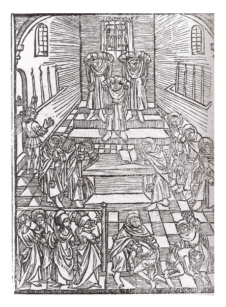
8. Johannes Pfefferkorn, Libellus de Judaica Confessione (Cologne, 1508), fol. 1b