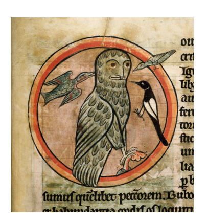
10. Owl , Harley MS 4751, fol 47r, thirteenth century