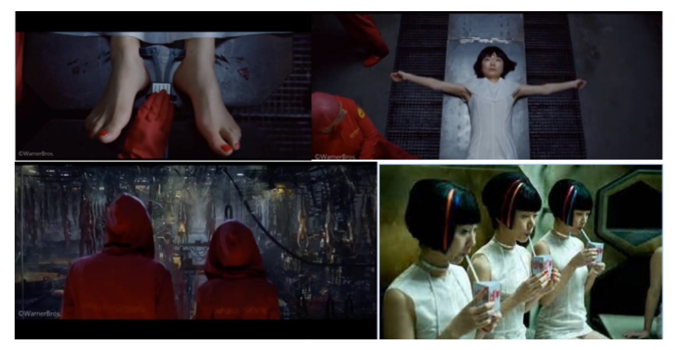
Figure 4: The slaughter ship and fabricants consuming soap in the film Cloud Atlas.

Sonmi-451" depicts a near-future world in which society is divided into "upstrata" consumers and "fabricant" slaves. As Nicholas Dunlop states, "the ontological status of the fabricant, though articulated as cognitively and definitively Other, is nonetheless perpetually unsettled in the narrative, oscillating between organic and inorganic, simultaneously manifesting properties of the machine, the human, the clone, and the cyborg" (Dunlop 216). Neither human nor other, the fabricants challenge and ultimately obliterate the distinction between the two. This transformation is illustrated in the revelation that food eaten by the Consumers in Nea So Copros and the "soap" consumed by the fabricants is produced by recycling fabricant bodies when their term of service is over (see Fig. 4):