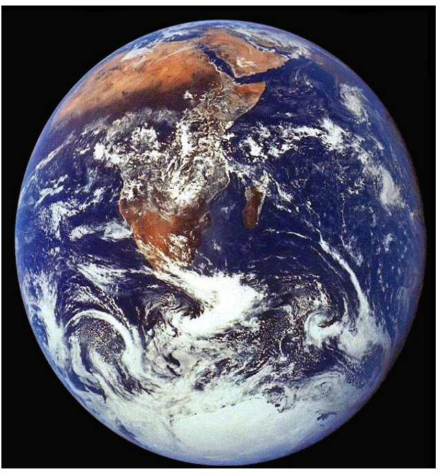
Figure 2: The Blue Marble.

Since its first appearance as an image, the blue planet has been deployed as an image of global unity, international collaboration and shared planetary interdependence. Instead of the horizon being the natural limit of humanity's expectations . . . 'mankind' encountered a planet made visible as a whole, discrete entity. Space became a new location from which to view ourselves, and this perspectival shift has produced both a new context for universalism and an added visual dimension by which the universe scales the order of things. In other words, the project of exploration in space now appears to offer the chance to transcend earthly geographies, marked by 'man's' petty squabbles over land and property, and to shift perspective—indeed to move beyond the notion of perspective