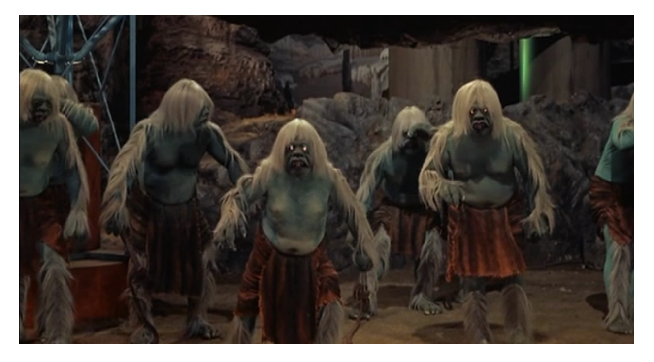
Figure 1: Image of the Morlocks from George Pal's 1960 film The Time Machine . But the Morlocks are spared as the gears of the machine turn, the teeth grind inexorably into each other, and the Time Traveller's humanity is asserted as his "disinclination to

such, the Morlocks are subject to the Time Traveller's sovereign right to kill.