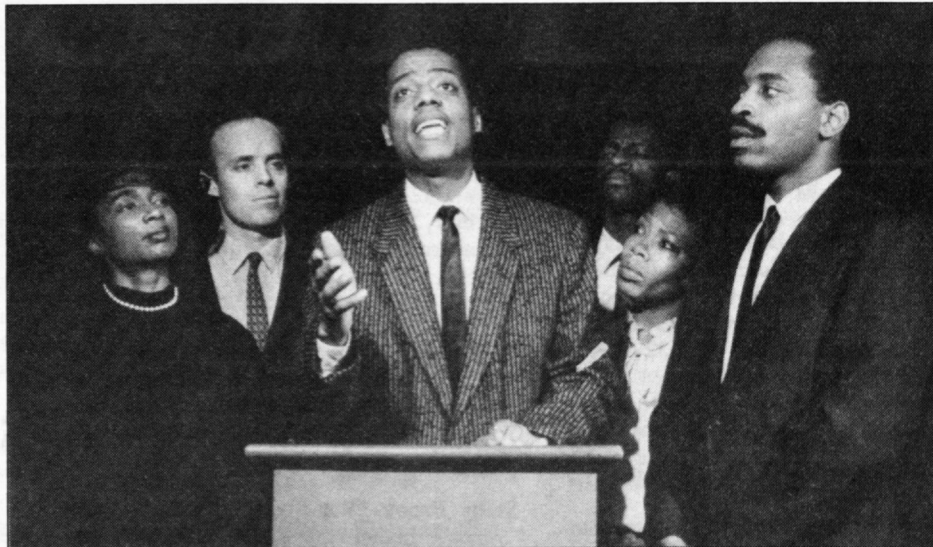
The National Black Touring Circuit will perform I Have A Dream , a musical drama based on the life and words of Dr. Martin Luther King, Jr., Friday, Feb. 16 at 8 p.m. at the Staller Center for the Arts. For information call 632-7230.

Sunday, Feb. 18: International Art of Jazz, Inc.