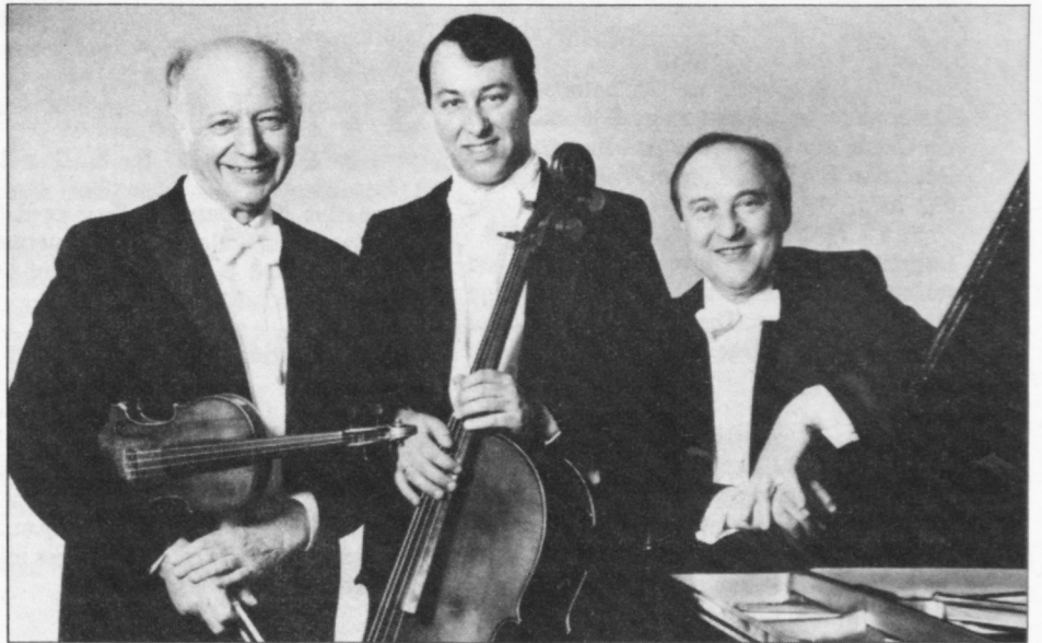
The Beaux Arts Trio; from left, Isidore Cohen, Peter Wiley and Menahem Pressler.

A suggested donation of $25 will benefit both the Center for Italian Studies and the Stony Brook Opera Ensemble. The University Art Gallery will be open before the performance, from 7 - 8 p.m., with an exhibit titled, Fiber Explorations , and a wine and cheese reception will follow. For information call the Center for Italian Studies at 632-7444 or the Staller Center box office at 632-7230.