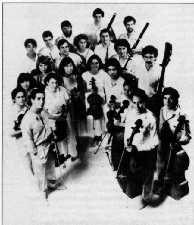
The Orpheus Chamber Orchestra will perform Friday, Feb. 23 at 8 p.m. at the Staller Center for the Arts as part of the Main Stage Music Series. For information call 632-7230.

Saturday, Feb. 3: Women's Basketball vs. St. Thomas Aquinas, 1 p.m.