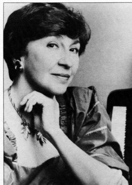
Pianist Bella Davidovich will perform Saturday, Dec. 16 at 8 p.m. on the Staller Center's Main Stage.