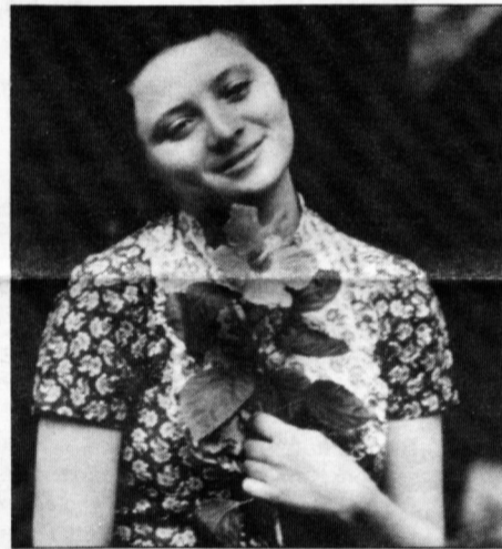
"Hour of the Star" playing Oct. 16.