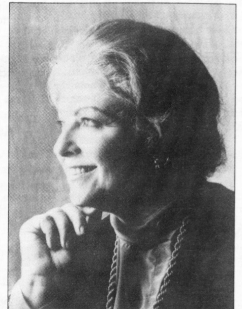
Sarah Weddington, the lawyer who successfully defended "Jane Roe" in the Supreme Court case Roe v. Wade will speak at the Staller Center Nov. 21.

Sunday, Oct. 29: Fourth Annual Special Olympics Fall Games. Games and activities include: bocce, volleyball, golf, table tennis, 400-meter walk, shuffleboard, live music, outside carnival (weather permitting) and clowns. Lunch provided by Taco Bell. Registration at 7:30 a.m. in the SB Gym. Spectators are welcome, volunteers needed. For information call 928-4489.