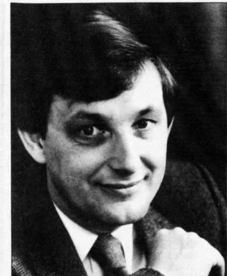
Trevor Pinnock and the English Concert will open the Staller Center for the Arts' tenth anniversary season Oct. 7 at 8 p.m. Tickets are $20, $18 and $16. For ticket information, call the Staller Center box office, 632-7230.

C.O.C.A. film, "Fanny and Alexander." 7 and 9:30 p.m., Auditorium, SB Union. $1, 50 cents with SBID.