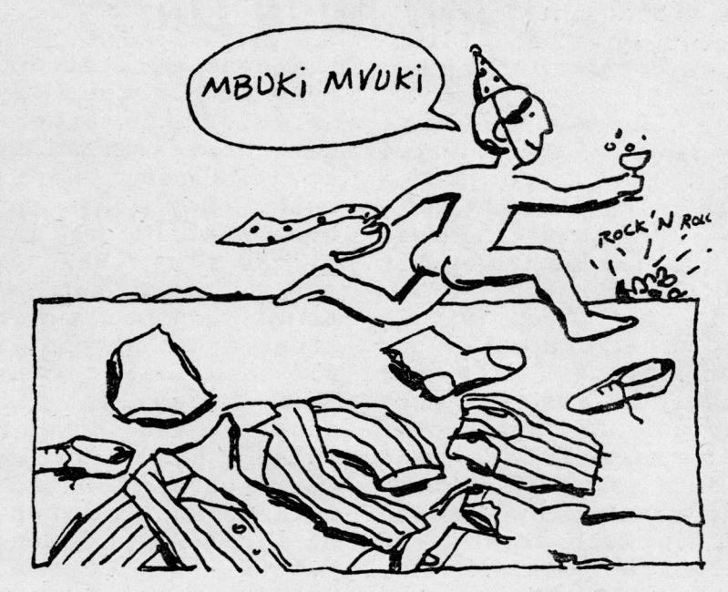
by Brian Mandel

Once upon a time, after Noah and the flood, the Torah tells us that "the whole earth was of one language and of one speech" (Genesis XI:1). Everyone in the world was united by one universal language. However, the people used this for self-exaltation and unworthy purposes. began to build a tower, later known as the Tower of Babel, in open revolt against G-d. The Rabbis claim that those who were building the tower wished to storm the heavens in order to wage war against G-d. The lives of their fellow companions were of less importance to them than the bricks that fell and broke. Due to their transgression, G-d frustrated their plan by dividing them through a diversity of languages. This is how the many languages we know have developed. As a tribute to the numerous languages now existing, we are listing several words that are found to be extremely amusing to us. We hope you enjoy them as much as we did.