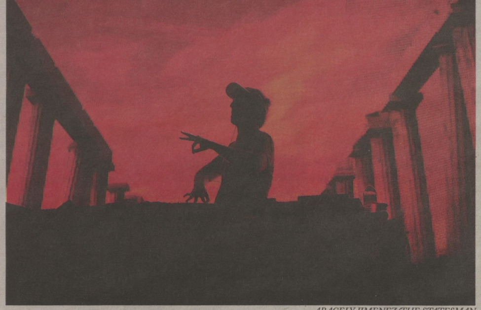
RL Grime mixes songs for his performance during Back to the Brook.