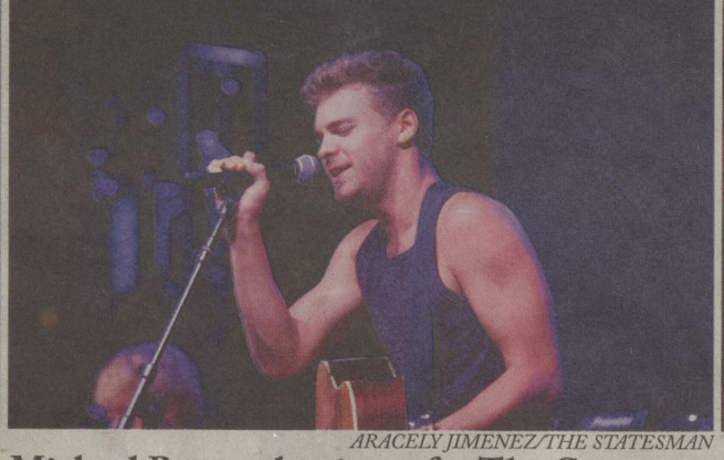
the top 40 of the U.S. Billboard Top 100 chart. performs in the opening act at Back to the Brook. take a selfie with Wolfie during intermission.