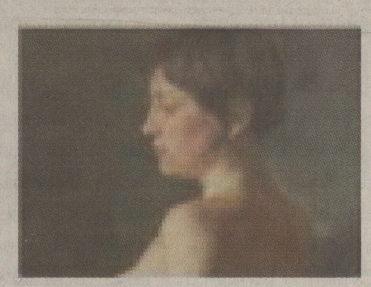
Figure Painting from Life Time: Wednesdays 6pm-9pm Artist Intructor: Kevin McEvoy This course in figure drawing and painting teaches students how to see the model by means of the signt size approach, and to learn the comparative measurements of the human form by means of comparative anatomy.

Portrait Painting from Life Time: Wednesdays 10am-1pm Addist Intrustors. Kesin McEvoy & Bill Grat Working from a live model, students tearn to draw and paint portraits. Building upon principles established in plaster cast drawing and painting, emphasis is placed on accuracy of shapes, mixing flesh tones, and captaining personality.