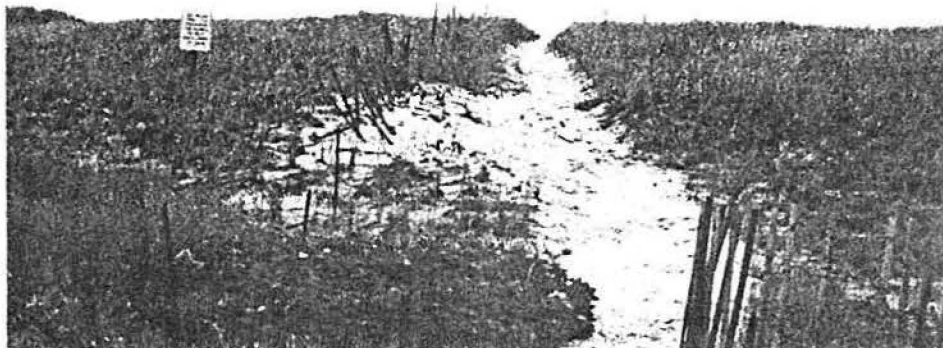
Figure 2 - The use of regular pathways will ensure minimal damage to beach vegetation when overwalks or planked walkways are not provided.