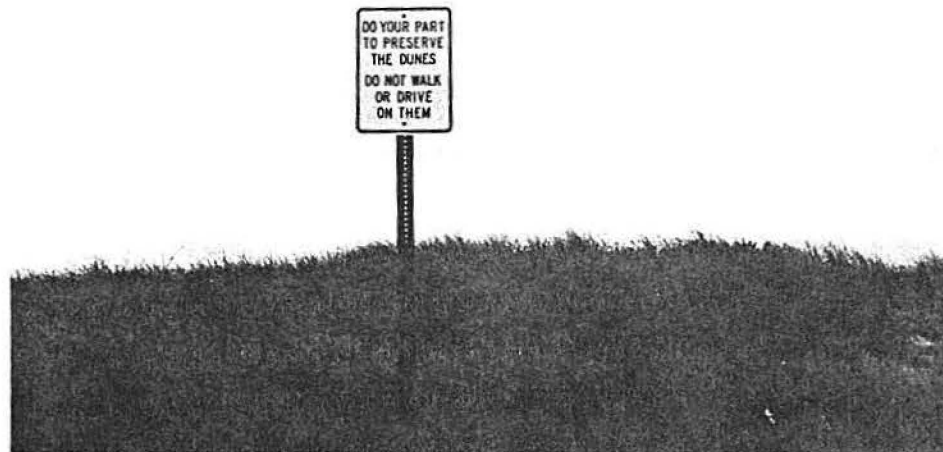
Figure 1 - Respect postings that regulate access to dune areas.