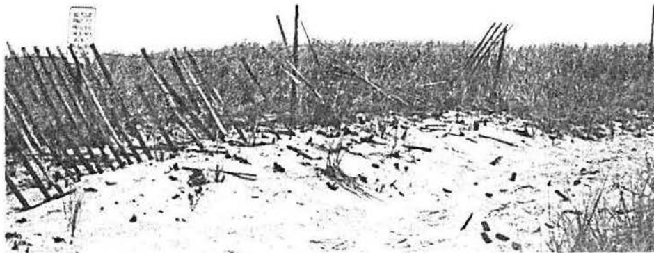
Figures 5 & 6 - Well maintained drift fences can promote the building of sandunes (top), but have little functional value and can contribute dangerous debris to the environment when neglected.