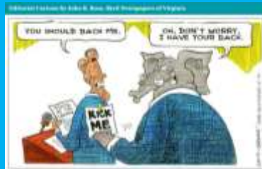
Cartoonists use exaggerated Language AND Art