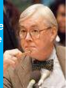
Daniel Patrick Moynihan (deceased) U.S. Senator from New York

Moynihan's Maxim: "Everyone is entitled to the own opinions, but they are not entitled to their own facts."