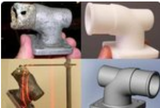
How 3D Printing is Revolutionizing the Auto Industry (TRP Connections)