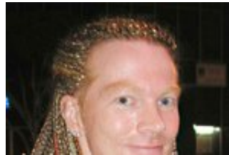
15 Good Looking Celebrities Who Destroyed Themselves with Plastic Surgery (She Budgets)