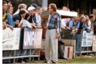
The day Harry Redknapp brought a fan on to play for West Ham 05 Sep 2013