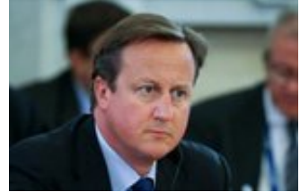
West and Russia clash over UK evidence of sarin gas attack in Syria 05 Sep 2013