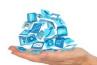
How to outsource your app development (PC World)