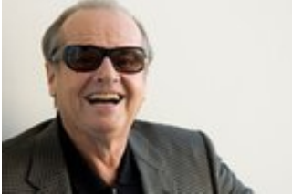
Jack Nicholson 'retires from acting due to memory loss' 05 Sep 2013