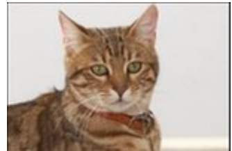
Your cat may be even smarter than you think (Hill's Pet)