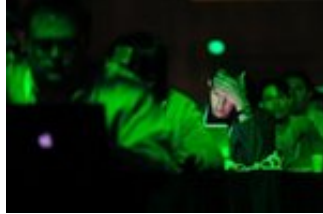
NSA surveillance: A guide to staying secure 05 Sep 2013