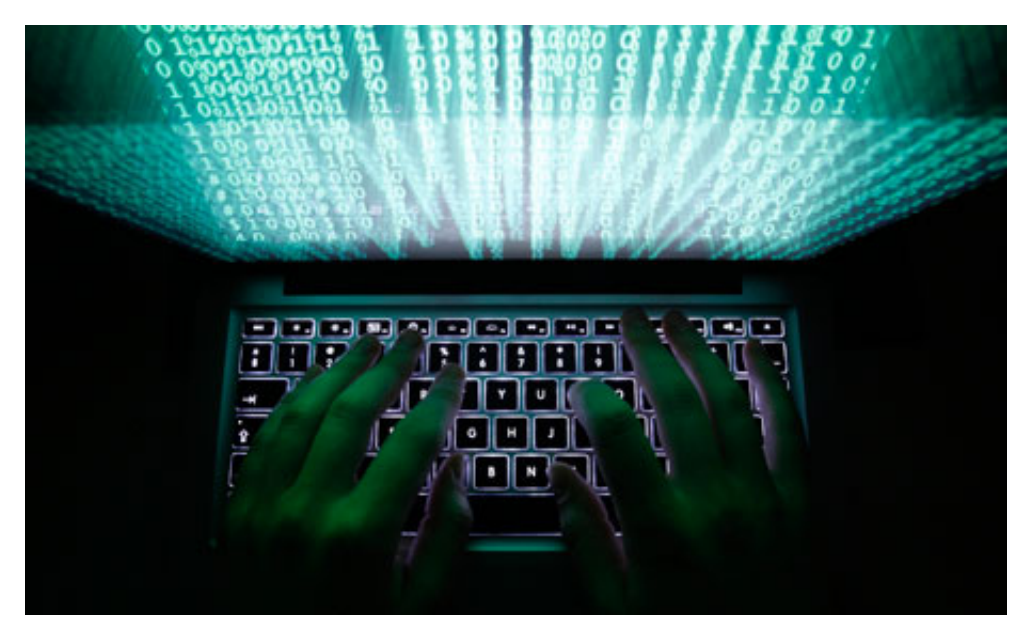
Through covert partnerships with tech companies, the spy agencies have inserted secret vulnerabilities into encryption software.

US and British intelligence agencies have successfully cracked much of the online encryption relied upon by hundreds of millions of people to protect the <u>privacy</u> of their personal data, online transactions and emails, according to top-secret documents revealed by former contractor Edward Snowden.